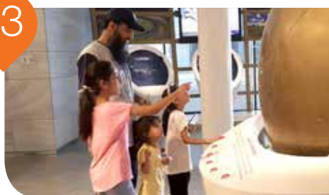
Abdullah Al-Salem Center's Visits