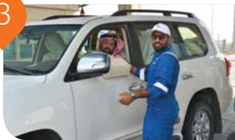
Saudi National Day