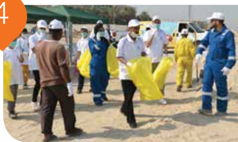
Cleaning up Shuwaikh Beach