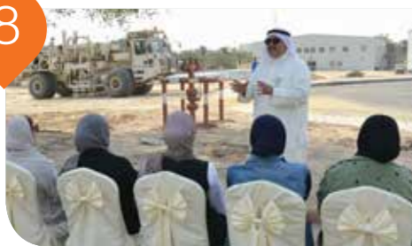
Seismic Vibrator Vehicle Exhibit