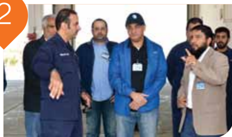
The CEO visit to WJO