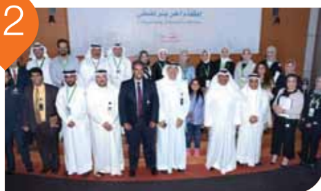
KGOC participates in the memory of Extinguishing Kuwait's Oil Fires