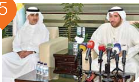
KGOC sponsors "It Deserves Protection" Environmental Campaign