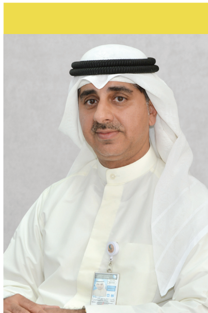
Manager (Corporate Planning)

It is my pleasure to provide you with the 2019 KGOC Business Calendar. It has been our endeavor to publish the business calendar at the start of the year in order to make each and every employee aware of the activities or business processes that the company is going to perform throughout the year and the associated timelines.