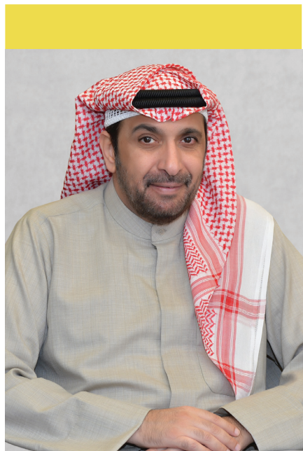
Ag. DCEO (Planning & Commercial Affairs)

The global oil industry is now going through a rough phase with the low crude oil prices. It has become imperative for oil producing companies, including KGOC, to be more efficient and cost effective than ever before in a low oil price environment.